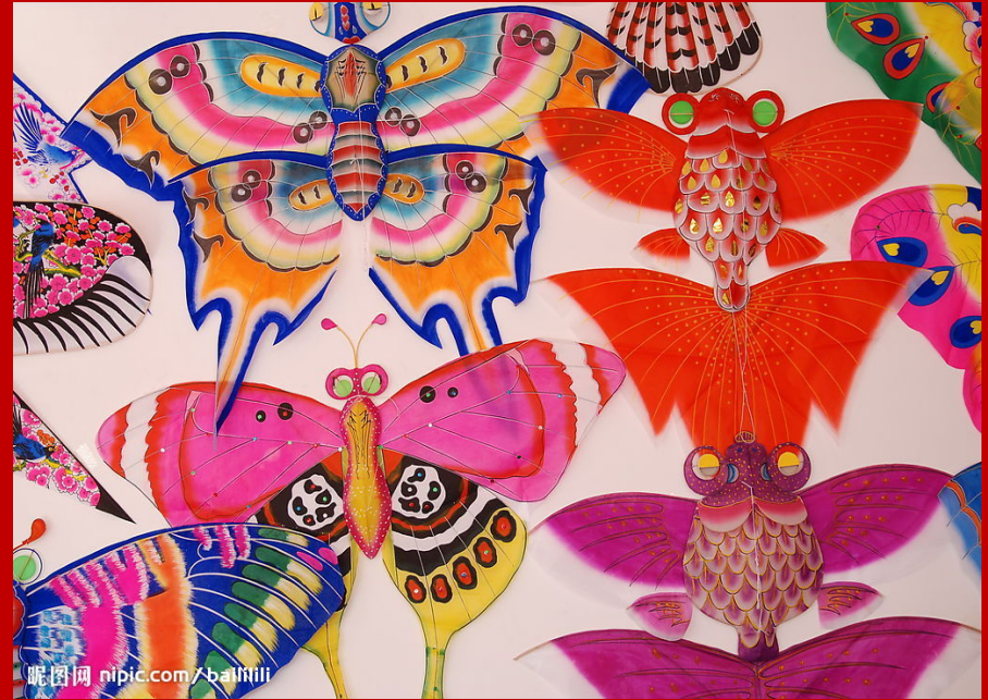
Exhibit Floor: San Francisco Library, South China Sea Art's decoration corridor

Introduction to chinese kite writing information, picture of each kind of style category of chinese kites